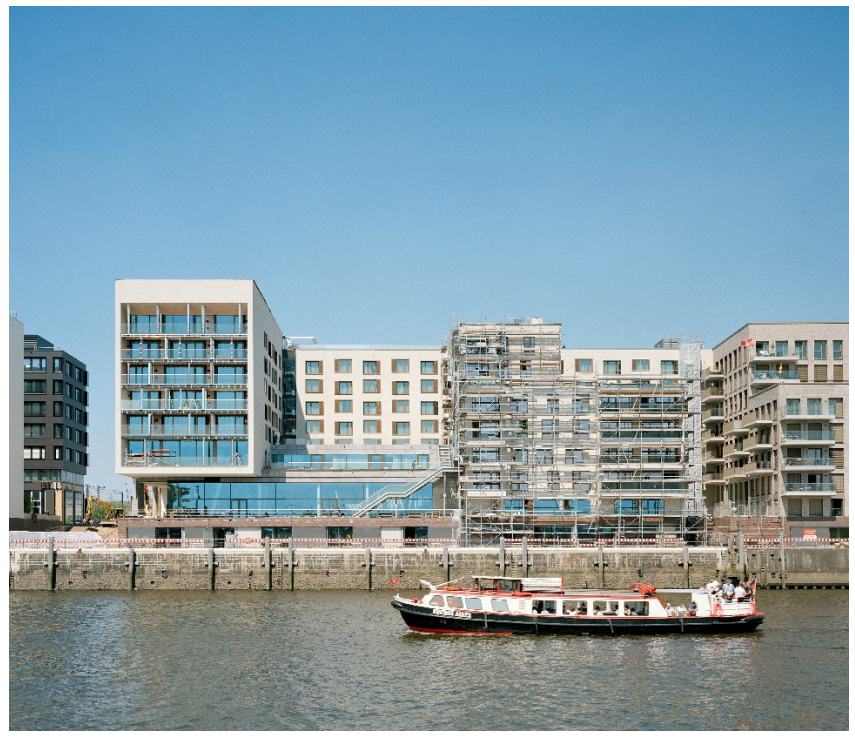
Photo 2: Campus Futura in Hamburg – a front-row seat by the River Elbe